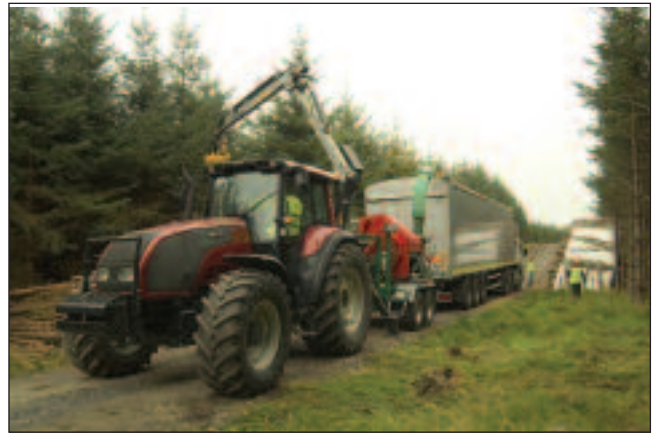
Figure 7: MusMax tractor-powered chipper blowing chips into a walking floor truck.