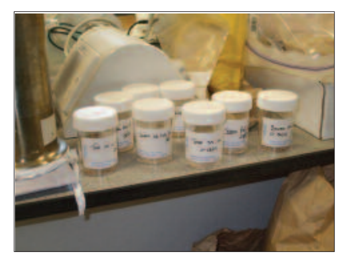
Figure 24: Wood samples for analysis.

The size distribution of chip particles was determined for every chipper used. Machines tested were both imported