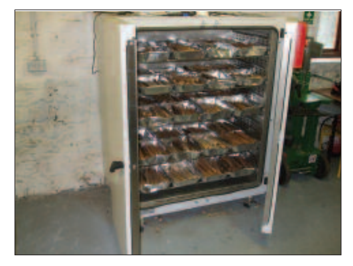
Figure 21: Samples in the drying cabinet for moisture content determination.