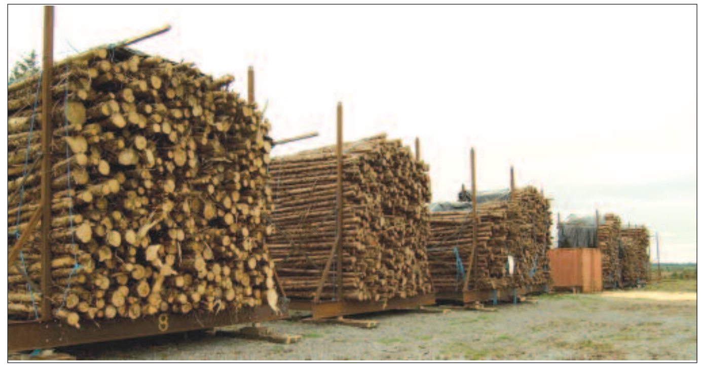
Figure 20: Dedicated bin storage trial.