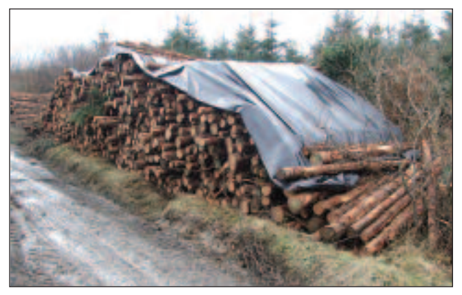
Figure 16: Stack of Sitka spruce pulpwood covered with plastic for seasoning.