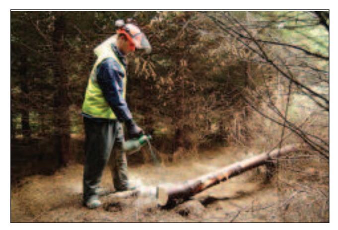
Figure 13: Stump treatment with urea solution after chainsaw felling.

• Whole-tree clearfelling of an area of birch natural regeneration by feller-buncher, seasoning in situ and terrain chipping with Silvatec chipper.