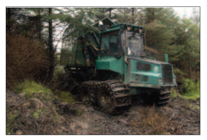
Figure 10: Silvatec chip forwarder leaving the extraction rack with a load of chips.