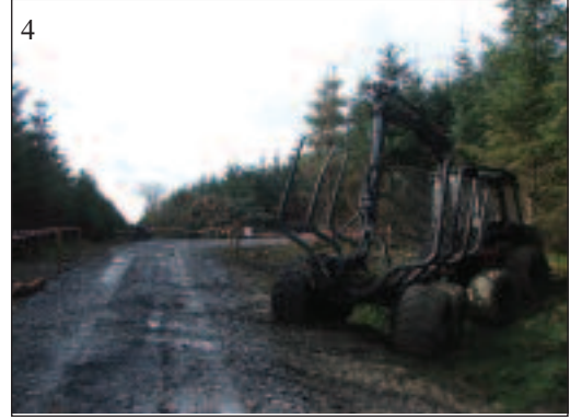
Figure 2: Silvatec feller-buncher carrying out a selection thinning. Figure 3: Silvatec harvester in pulpwood harvesting. Figure 4: Valmet forwarder.

• Selection thinning with feller-buncher, seasoning in the stand and chipping with terrain chipper.