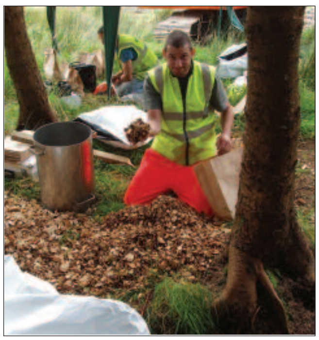
Figure 14: Sampling wood fuel for moisture content.

In all cases, chipping was carried out after a seasoning period to allow the moisture content in the wood to fall. In all the conifer trials, whole trees and the two assortments (energy wood and pulpwood) were left in the forest for one or two summers and then chipped. The assortments were either left uncovered or covered by plastic or paper. The initial moisture and final moisture content were measured and conclusions on how to store roundwood in the forest were drawn. In the broadleaf trials, the effect of seasoning was investigated on whole trees, logs and on split firewood.