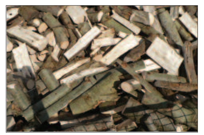
Figure 18: Ash split for firewood.

A dedicated storage trial was established, where the weight loss of stacks of wood could be monitored over time. The purpose was to establish the rate of weight loss, depending on storage duration, and on the commencement of storage. Both pulpwood and energy wood were investigated. Of the eight stacks, one was left uncovered, while the others were covered over the top. Stacks at the storage trial site were compared to similar stacks in the seasoning trials.