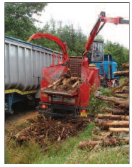
Figure 11: Starchl chipper blowing chips into truck.