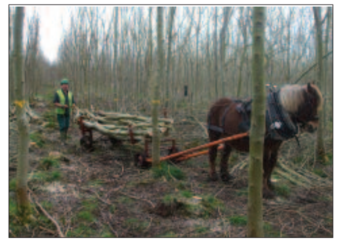
Figure 12: Horse and forwarding trailer.