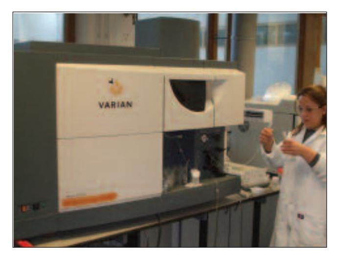
Figure 26:Element analyser.

machines from the continent, and those owned and operated by Irish contractors. Size distribution is an important factor in deciding the size of boiler in which chips can be used.