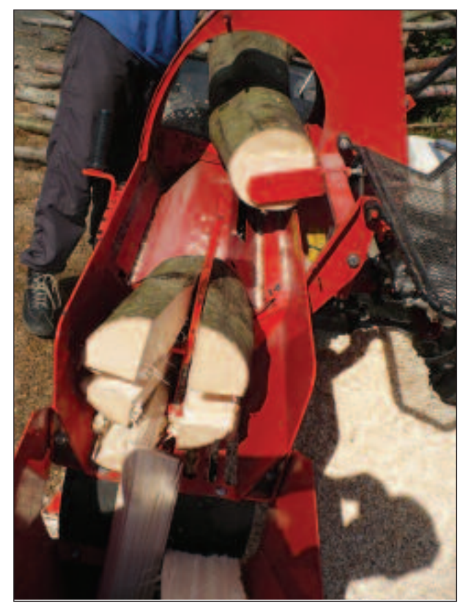
Figure 17: Splitting ash with a Hawk firewood processor.

At each of the conifer plantations investigated in 2007 large net bags of firewood were produced and stored under different circumstances to see how they dried. In the hardwood stands, small net bags of firewood were produced and stored under different conditions.