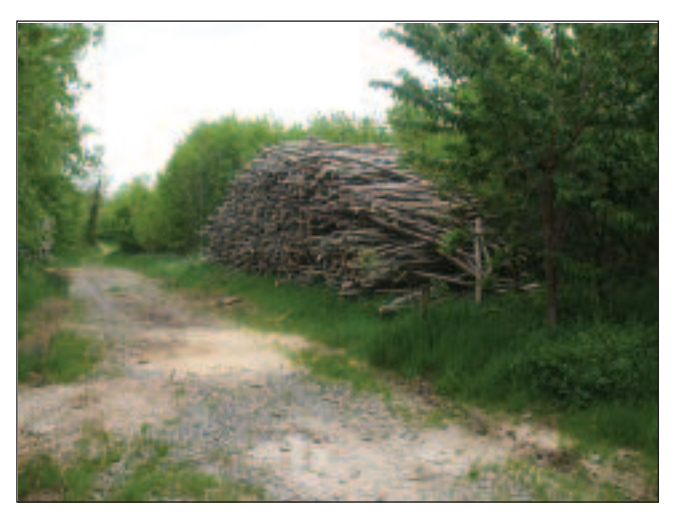
Figure 15: Stack of ash left uncovered in the forest.