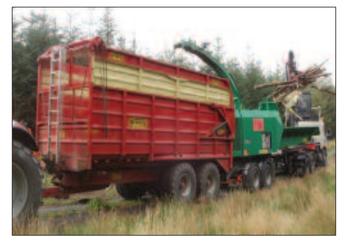
Figure 5: Jenz 700 truck chipper feeding into a tractor-trailer combination.