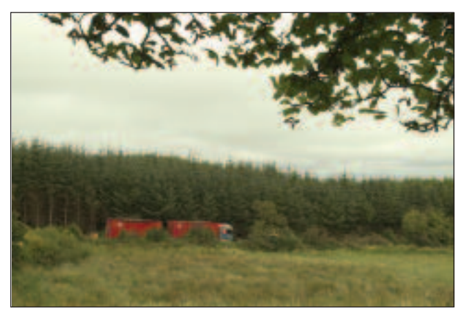
Figure 6: Container truck leaving the forest with a load of chips.